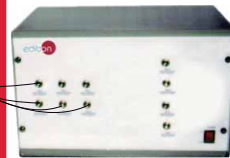
② Control Interface Box