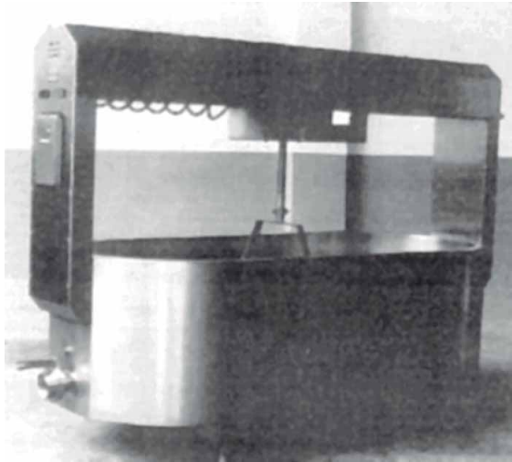
① Unit: CCDC. Teaching Curdled Tank