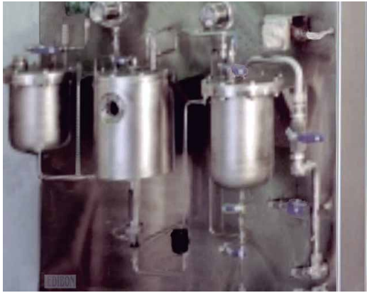
① Unit: AUHTC. UHT Unit